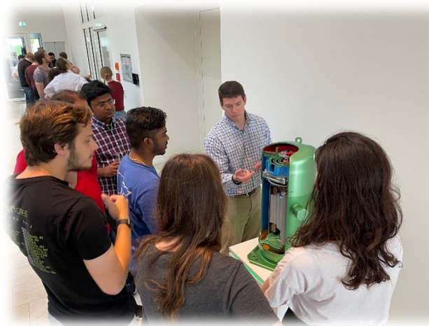
SCHAUFLEER Academy, Rottenburg (IRCC 2022)