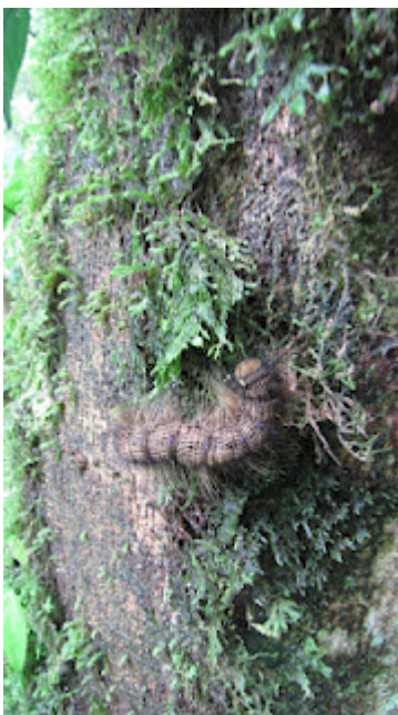
This is a giant caterpillar that I almost put my hand on when trying to avoid a mud puddle.