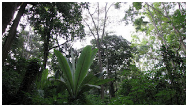
rain forest shot